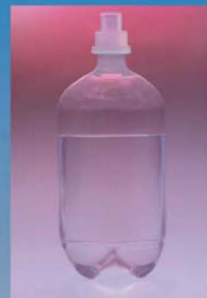
ALSO WITH IRRIGATION CAP