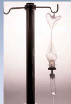
TOTAL BOTTLE COLLAPSE