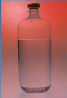
STERILIZATION AT 121°C